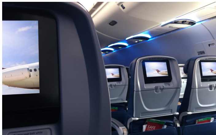
ExpressPlay DRM Offline secures Panasonic's in-flight content, delivering a seamless and protected entertainment experience for passengers.